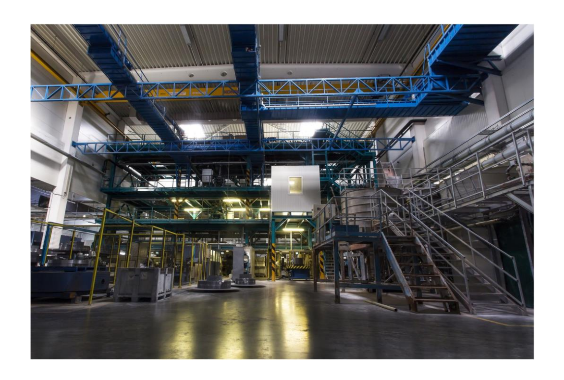
Accomodation (SIMILAR CONDITIONS)